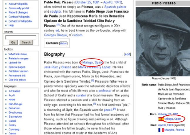
Figure 3: Wikipedia page describing Pablo Picasso. Note how the same information (regarding Picasso’s birthplace, in this case) is described both in text and through an infobox, a feature that we exploit in our work.

have relaxed the notion of set subsumption by requiring only that there is a significant overlap among the two sets. However, we also constrained that the smaller set is smaller by at least a given factor in order to exclude cases where the two sets are of similar size (and therefore we can speak of similarity instead of subsumption). Further, to compute support we considered the size of the broader set.